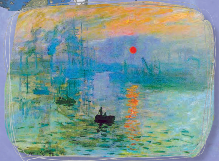
Impression, Sunrise (1872) by Claude Monet