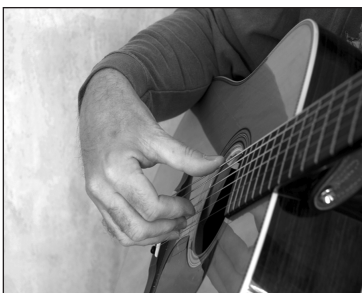
Figure 12 (incorrect)