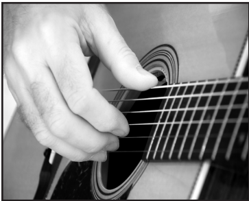
Figure 3 (correct)