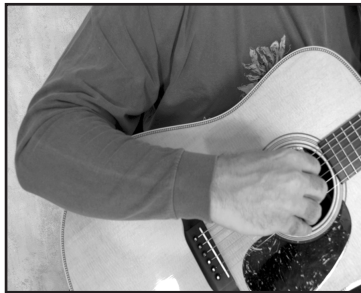
Figure 5 shows proper right-hand wrist alignment, while Figures 6 and 7 show an improper approach in which the wrist is deviated and not in the natural relaxed position shown in Figure 5. The wrist needs to be aligned with the arm’s muscles so that the fingers pull the strings in a straight line.