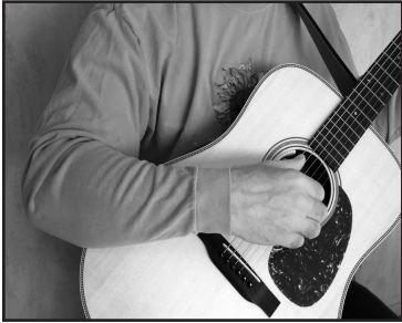
Figure 1 (correct)