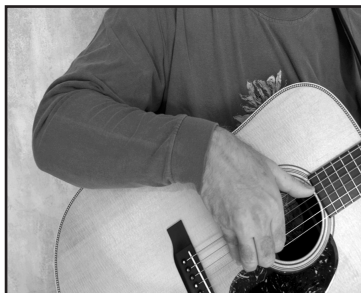
Figure 6 (incorrect)