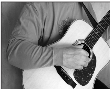
Figure 5 (correct)