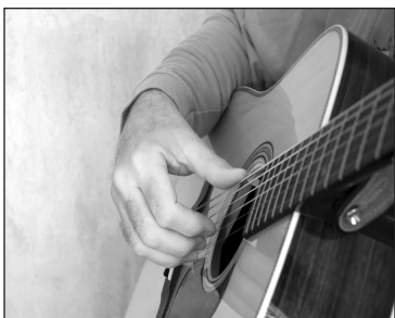
Figure 11 (correct)